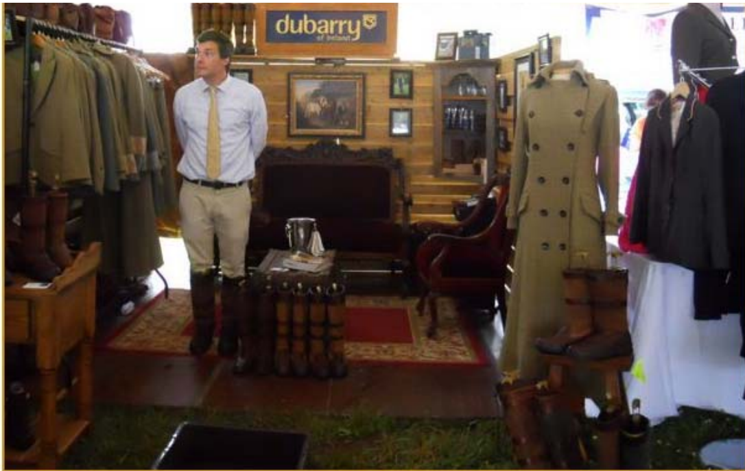
The Dubarry of Ireland booth under the tent.